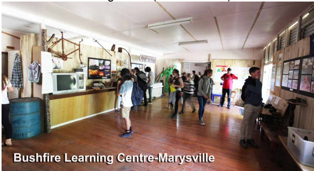
Bushfire Learning Centre-Marysville