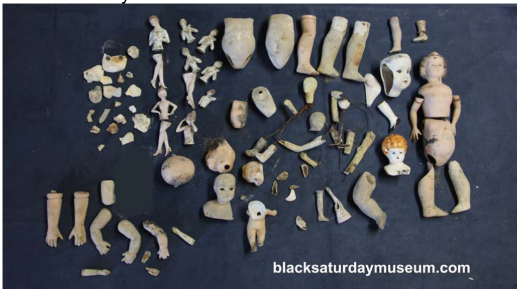
Collection of rare antique dolls found in the rubble (display)